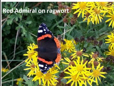
Red Admiral on ragwort

This year there were huge numbers of butterflies, especially painted ladies, plus quite a lot of cinnabar moth caterpillars on the ragwort.